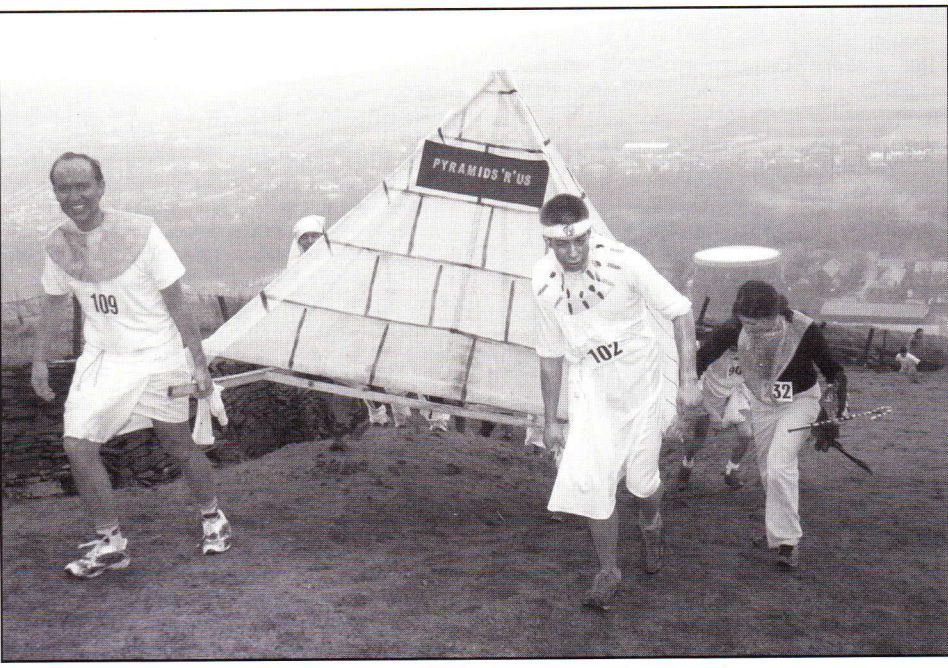
The "Pyramids 'R' Us" team at Whinberry